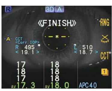
Compensated patient's IOP