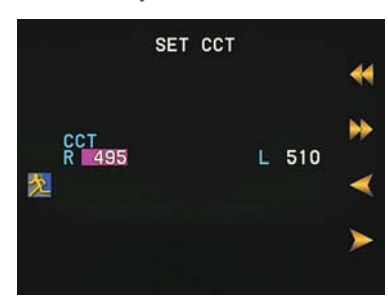
Entered patient's corneal thickness

By entering patient's central corneal thickness, the operator can compensate the patient's IOP. The IOP compensation provides the correlation between the IOP and central corneal thickness, as LASIK patient's IOP changes between pre and post operation. *NT-530 Only